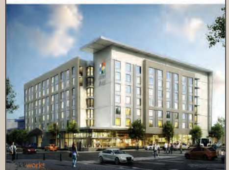
Pena Station Hyatt Place