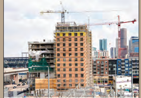
Hilton Garden Inn Denver Union Station